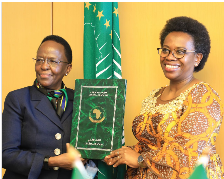
Her Excellency Ambassador Liberata Mulamula (MP), the Minister for Foreign Affairs and East Africa Cooperation together with the Depute Chairperson of African Union, Dr. Monique Nsanzabaganwa, displaying the treat of establishment of AMA after signing on 10th August 2021 in Addis Ababa, Ethiopia

in collaboration with the WHO, the African Medicines Regulators Conference (AMRC) and other bodies, meetings related to medical products regulation in Africa. In addition, AMA will provide regulatory guidance, scientific opinions and a common framework for regulatory actions on medical products, as well as priority and emerging issues and pandemics in the event of a public health emergency on the continent with cross border or regional implications where new medical products are to be deployed for investigations and clinical trials. The AMA treaty is expected to be tabled to the Parliament of