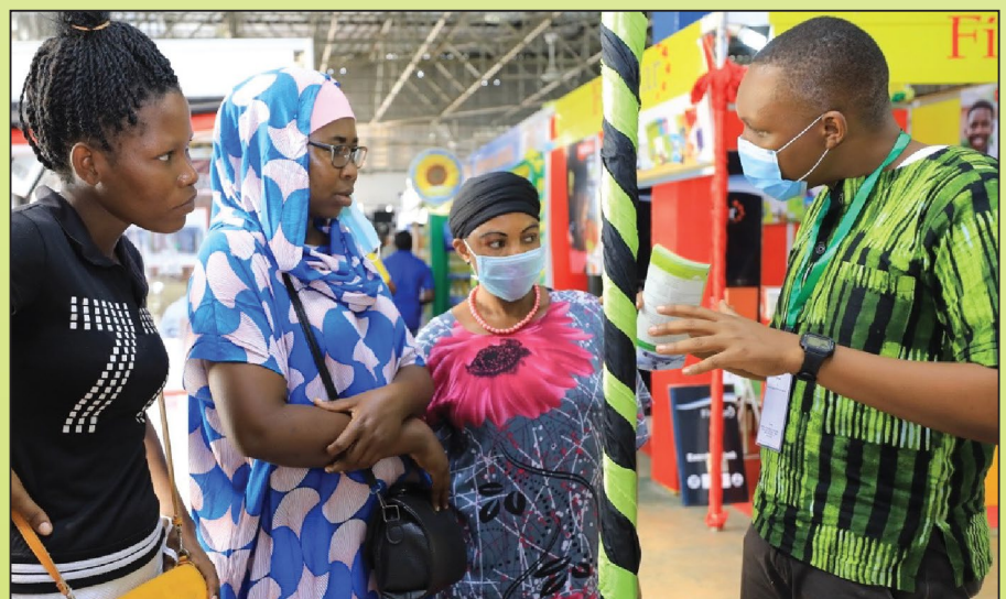
Public Education on rational use of medicines, medical devices and diagnostics.

"The culprit was seen altering expiry dates on the products by using stamps and sell them to the public" the whistleblower asserted.