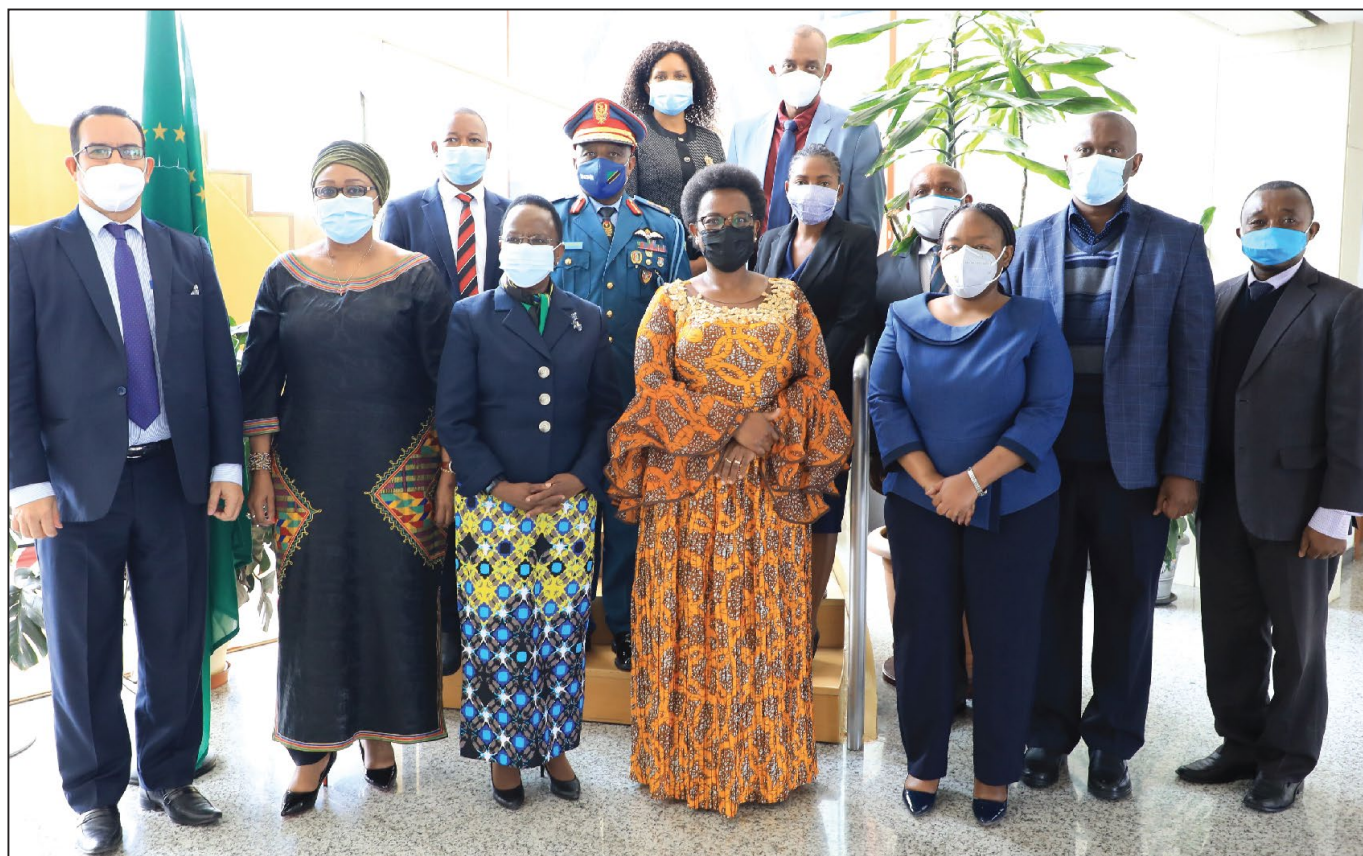
Members participated in the signing the Treaty for Establishment of the African Medicines Agency (AMA) poses in a group photo during the exit of the event which was held on 10th August 2021 in Addis Ababa, Ethiopia