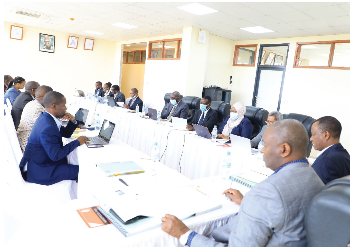
The Ministerial Advisory Board (MAB) in one of its regular meetings to oversee the Authority functions held on 15th September, 2021 in Dodoma

Tanzania's industrialization agenda is implemented on the back of the National Development Vision 2025, which envisages a semi-industrialized, middle-income economy by 2025.