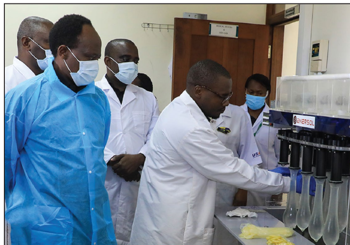
Deputy Minister of Health, Community Development, Gender, Elderly and Children, Hon. Dr. Godwin Mollel (MP), witnessing how analysis of medical devices is done during his official visit to TMDA laboratory located in Dar es salaam on 21st May, 2021 to assess the performance of TMDA in implementing its role of protecting public health.