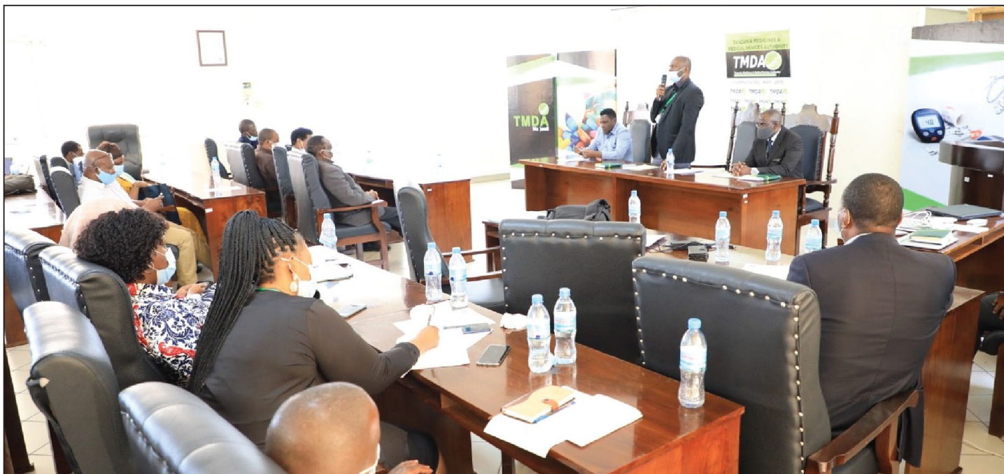
Annual Pharmacovigilance Stakeholders meeting held on 30th June 2021 at TMDA conference hall in Dar es Salaam