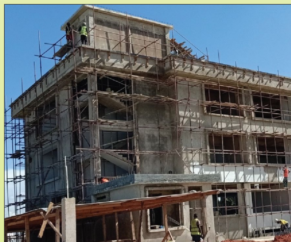
TMDA Central Zone building construction

The Ministerial Advisory Board (MAB) together with TMDA Management team are in a group photo immediately after visiting the ongoing construction of Central Zone office project in Dodoma. The project is expected to be completed on June 2021 under National Housing Cooperation as a main Contractor