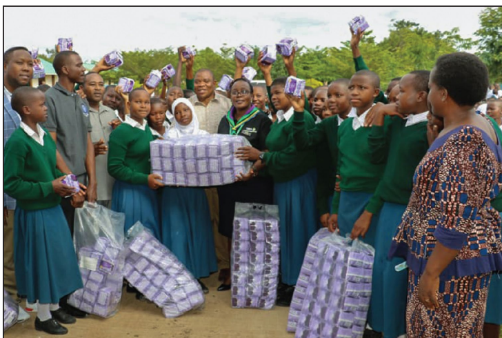
TMDA donated 3192 packs of pads as part of Corporate Social Responsibility (CSR) to support Simiyu secondary schools female students who are in a special academic program organized by region as part of their preparation for the national exams