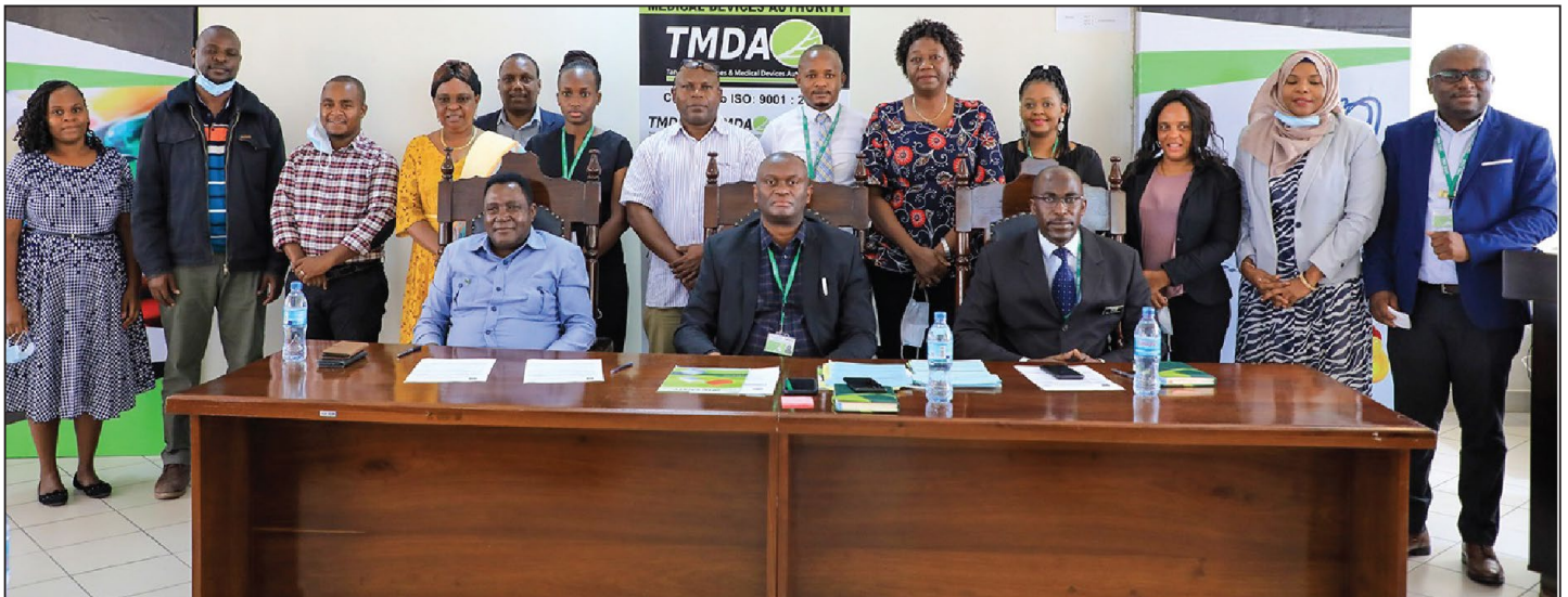
Annual Pharmacovigilance Stakeholders meeting held on 30th June 2021 at TMDA conference hall in Dar es Salaam