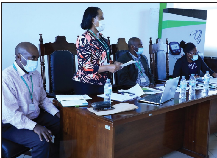
TUGHE election which took place on 25th July, 2021