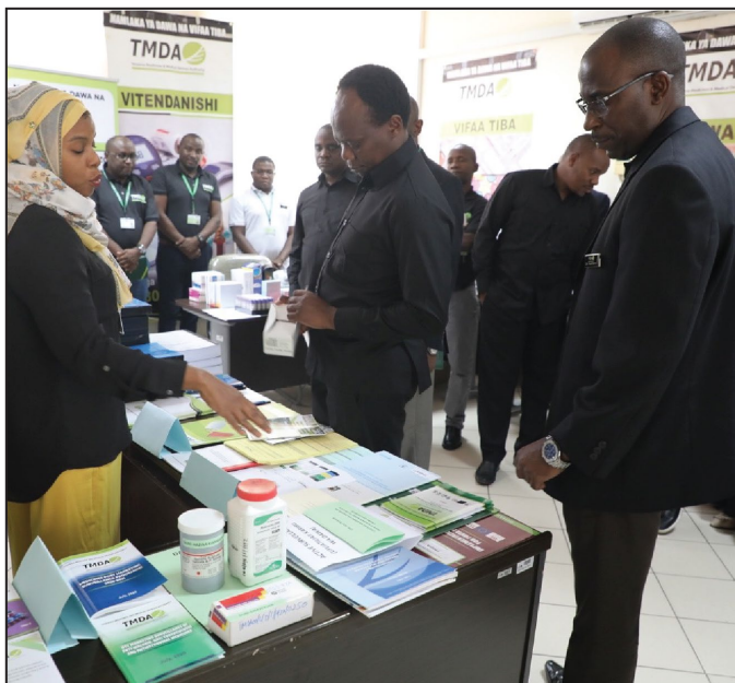
Deputy Minister of Health, Community Development, Gender, Elderly and Children, Hon. Dr. Godwin Mollel (MP), get wind of information on TMDA functions during his official visit to TMDA Offices located in Dar es Salaam on 21st May, 2021.