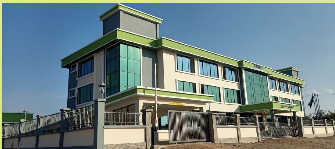
The Newly constructed TMDA Central Zone building in Dodoma