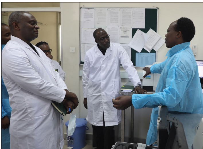
Deputy Minister of Health, Community Development, Gender, Elderly and Children, Hon. Dr. Godwin Mollel (MP), giving directives to TMDA management during his official visit to TMDA laboratory located at in Dar es Salaam on 21st May, 2021.