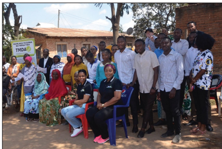
TMDA provided education on the role of TMDA, the proper use of medicines and how to report Adverse Drug Reactions to social groups at kihonda ward in Morogoro district during the outreach campaign held from 23rd to 27th August, 2021