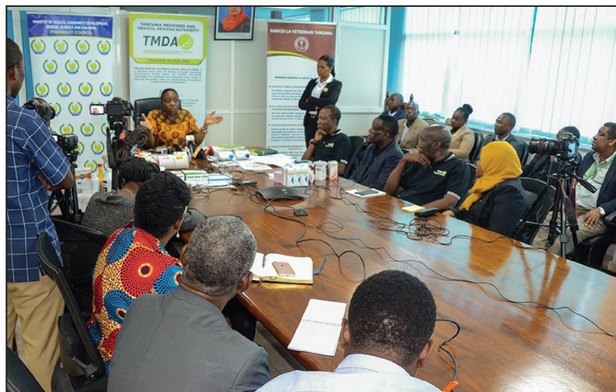
Minister of Health, Community Development, Gender, Elderly and Children, Dr. Dorothy Gwajima (MP), addressing the media on outcome of special operation inspection of business premises dealing with medicine and medical devices which was conducted countrywide between 15th to 20th March, 2021.

The commitment and innovation in improving and updating the service delivery system in-line with the changing needs and expectations of its esteemed customers has enabled the Authority to attain and maintain the certification status for four consecutive periods of every three years since its first certification in 2009.