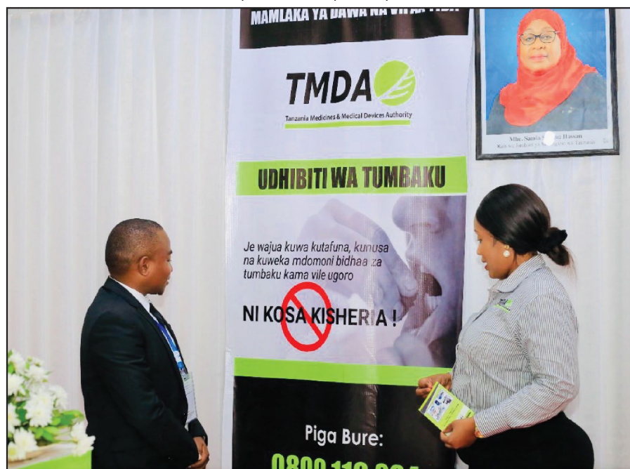
Public education on Tobacco Products control

The goal of the TMDA is to protect and promote public health through creating a tobacco free society and to foster individual, community and government responsibility to prevent tobacco use by enabling multisectoral participation in tobacco control.