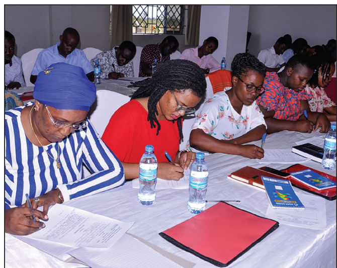
Capacity Building to Inspectors