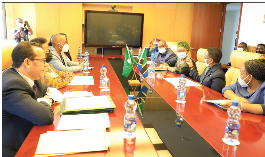
Establishment of the African Medicines Agency (AMA) at the African Union Headquarters in Addis Ababa - Ethiopia held on 10th August 2021.

According to the Charter on AU Treaties, the AMA Treaty will enter into Force 30 days upon the deposit of the 15th instrument of ratification at the Commission. The Commission expects to have the establishment and operationalization of the AMA in full progress in 2022.