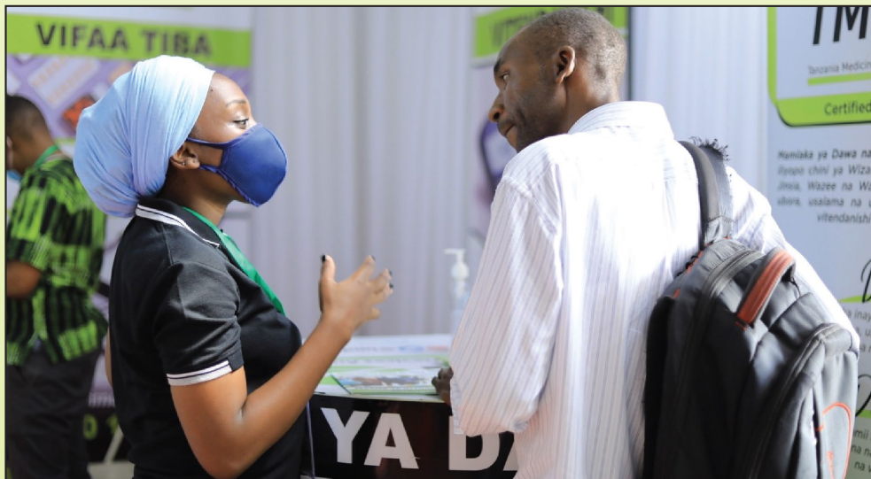
Public Education on rational use of medicines, medical devices and diagnostics

In connection to TMDA's efforts in curbing illegal manufacturing and fraudulent mislabeling of medical products in Tanzania, a consignment of expired medicines and medical devices worth TZS 7.7 million had been captured in Mbeya city on 25th August 2021.