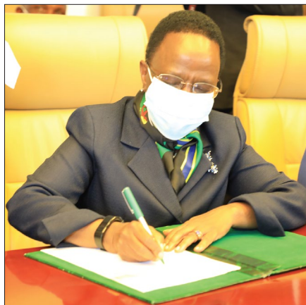
Her Excellency Ambassador Liberata Mulamula (MP), the Minister of Foreign Affairs and East African Cooperation signed the Treaty for Establishment of the African Medicines Agency (AMA) at the African Union Headquarters in Addis Ababa - Ethiopia on 10th August 2021.

On 10th August, 2021 at the African Union Headquarters in Addis Ababa, Ethiopia, Her Excellency Ambassador Liberata Mulamula (MP), the Minister of Foreign Affairs and East African Cooperation, officially signed the Treaty for