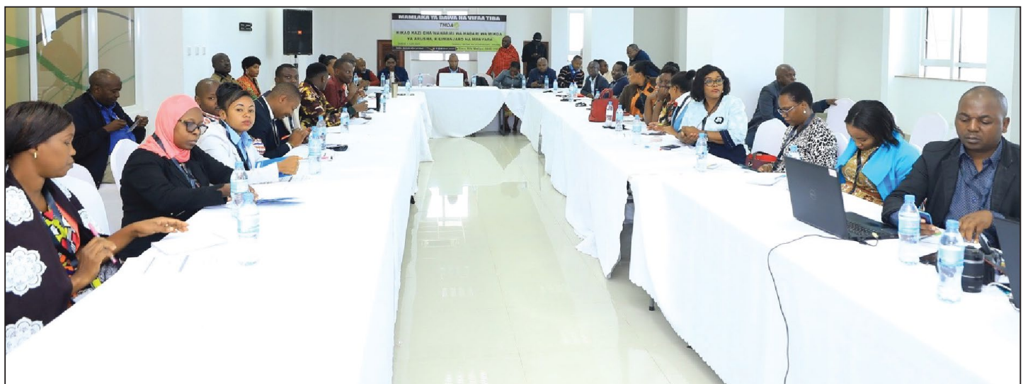
An official meeting between TMDA and Journalists of Arusha, Kilimanjaro and Manyara region held on 3rd June, 2021 in Arusha City.