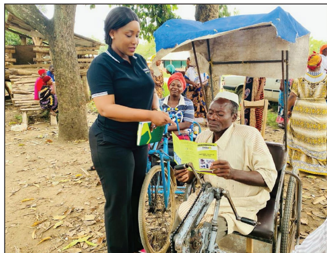
Together we protect and promote public healthy