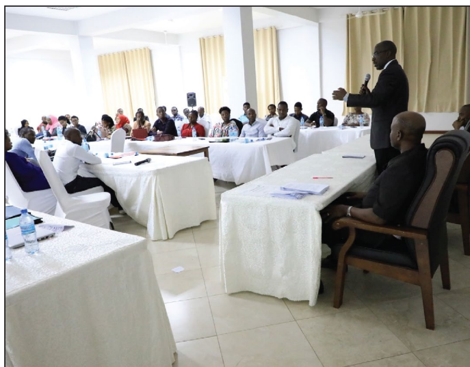
Capacity Building to Inspectors