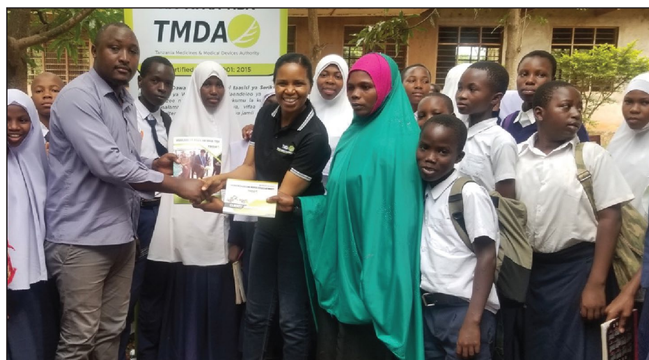
Establishment of TMDA School clubs in Morogoro Region