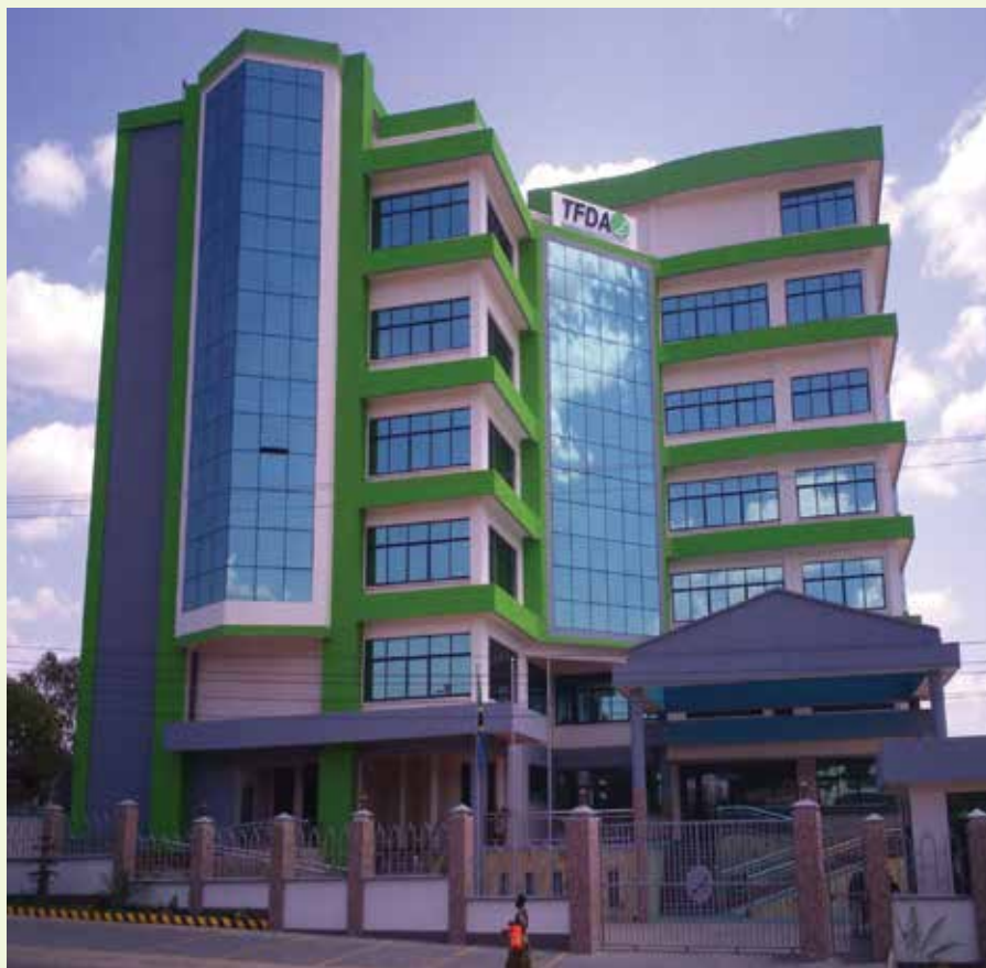
TFDA Lake Zone Laboratory and Office Building in Mwanza